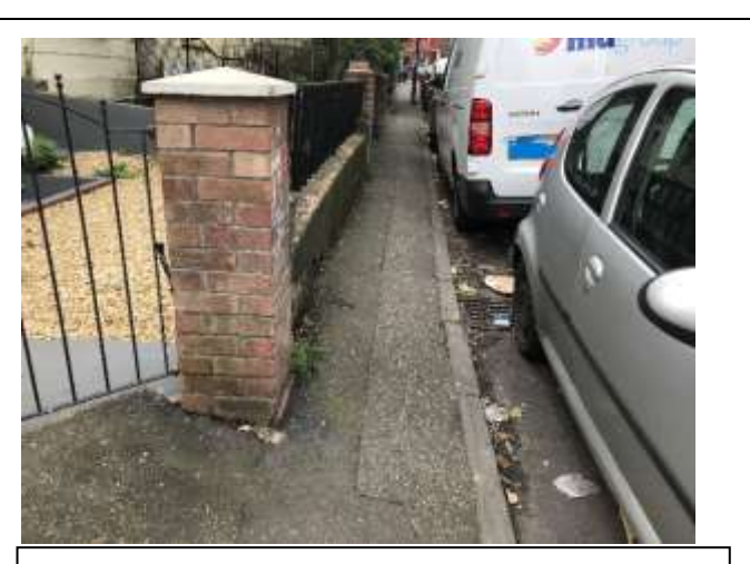
Narrow pavement Ashely Road leading to Brigstocke Road

Driveway providing dropped kerb in front of the Seventh Day Adventist Church, however no dropped kerb opposite until you reach the corner of Brigstocke Road.